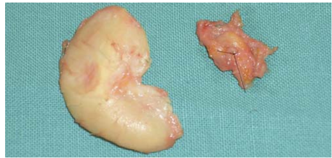
FIGURE 2. Left, Auricular concha. Right, Perichondrium with a suture of 6.0 nylon on its outer surface.

anatomic structures beneath it as soon as the watery component is dispersed. To this end, it can be useful to apply light pressure from the outside, combined in any case with careful taping of the nasal ridge at the end of the operation. The graft can also be used in a very similar way to deal with scar adhesions between the skin and the supporting structures beneath. In such situations, the 2 layers are separated and the graft is inserted between them to provide thickness, permit sliding, and prevent relapse.