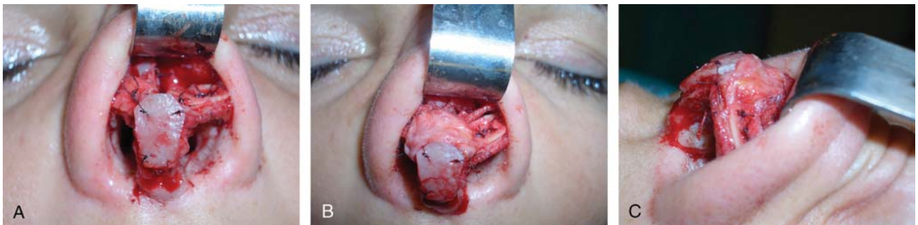
FIGURE 3. A, Reconstruction of the nasal tip with lateral crural and shield grafts (Sheen type) harvested from the cartilage of the auricular concha. B, Graft of the perichondrium stretched over and secured to cartilaginous grafts to make the contours smooth and disguise tip grafts. C, Lateral view of the same graft.